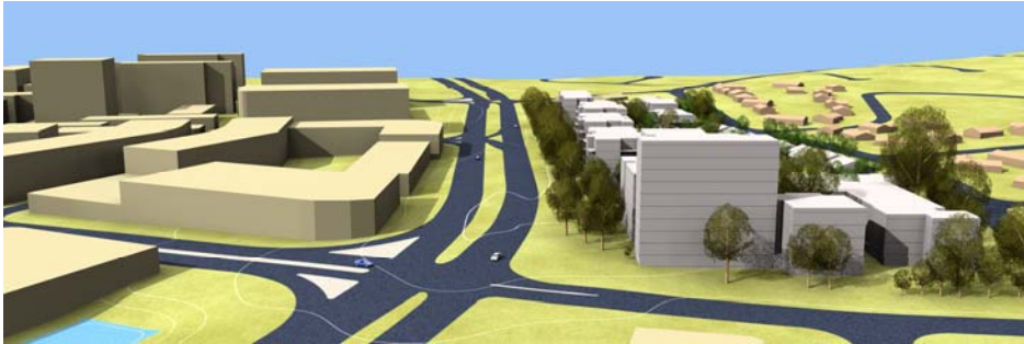
Proposed Future Development in relation to Woden District Context