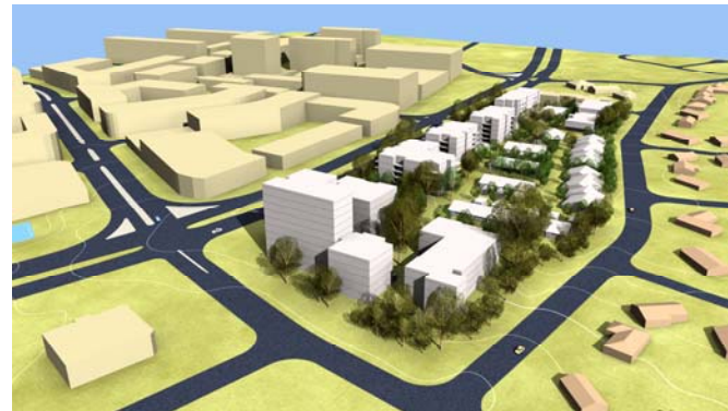
Northern Aerial View with Future Development