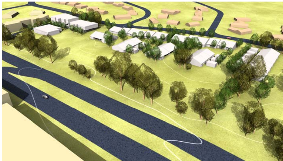
Eastern Aerial View onto Current Proposal