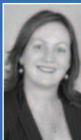
Senator the Hon Kay Patterson